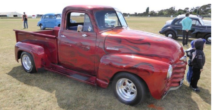
Proceeds of over $4000 from the Show will be donated to the local Girl Guides to assist in the upkeep of their Guide Hall.