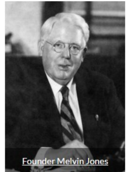
Founder Melvin Jones

Be sure to download the Touchstone Stories and share them in your Lions newsletter, website and Facebook page so everyone can experience the history of the largest service club organization in the world.