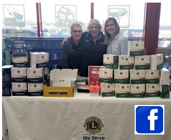
Pictured above: Lions Club of Hobart Town selling cakes at Bunnings Glenorchy.