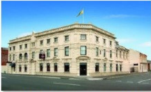
Grand Hotel Launceston $206 Call direct: 6331 5511 www.thegrandhotellaunceston.com.au