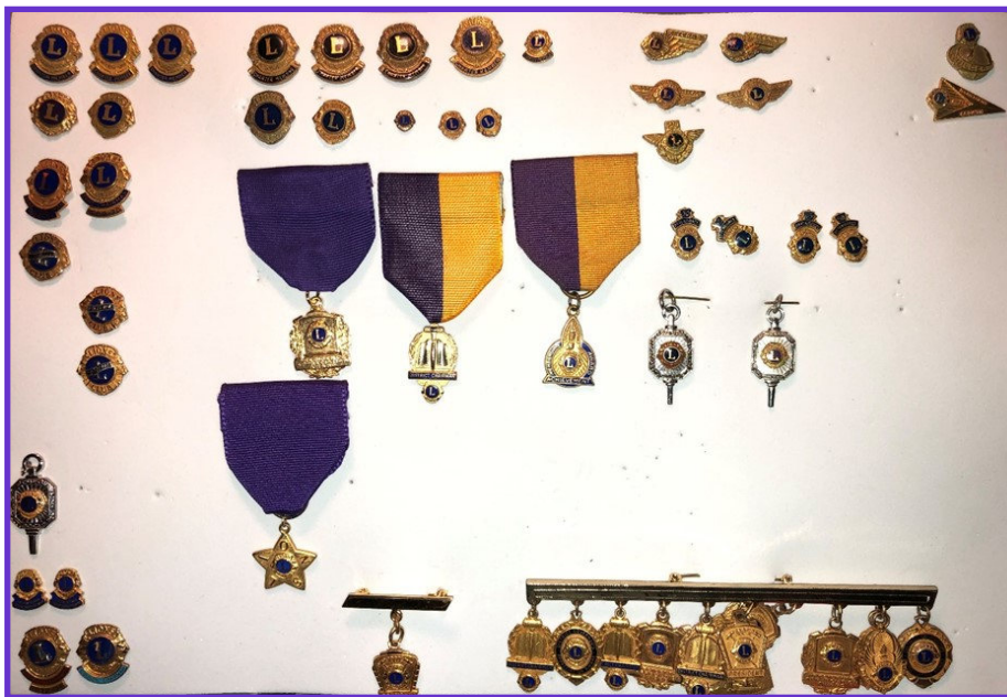
Some award pins I have collected over the years