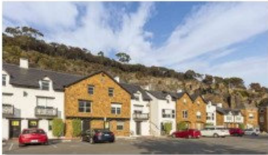
Leisure Inn Penny Royal $252 Call direct: 1800 026 370 www.leisureinnpennyroyal.com.au