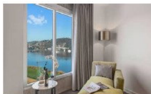
Peppers Silo Hotel $448 Call direct: 1300 737 444 www.peppers.com.au/silo/

Prices 1 st September 2020 - 2 Nights, Double (Guide only) there are plenty of other options and different offers.