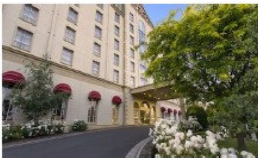
Hotel Grand Chancellor $284 Call direct: 6334 3434 www.grandchancellorhotels.com