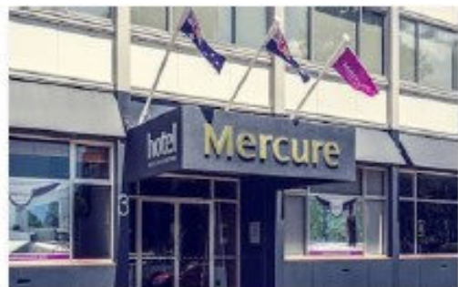
Mercure Launceston $248 Call direct: 6331 2055 mercurelaunceston.com.au