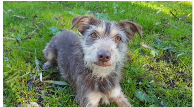
“Dusty” was rescued from Yorke Peninsula Puppy Rescue, and now lives in a loving home as an Australian Lions Hearing Dog.

Australian Lions Hearing Dogs is a national Lions organisation based in South Australia, who procure, train and place Hearing Assistance Dogs with people who are Deaf and Hard of Hearing, all around Australia. We are helping to address the silent and growing issue of deafness in Australia. You may not know that 400,000 Australians suffer from severe or profound hearing loss, and the number is increasing rapidly.