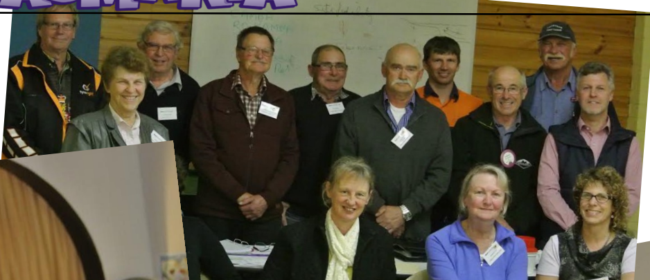
Some of the Members of the soon to be Legana and District Lions Club @May meeting