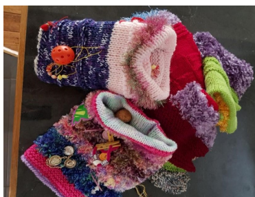
Left: Twiddle-muffs are also good for people experiencing dementia and other mental illnesses.

Twiddle-muffs are sensory comforts for people with restless hands. They are essentially woollen hand warmers with lots of bits and pieces attached for people to fiddle with. They are made in bright colours and decorated inside and out with lots of different shaped, sized and textured objects. The muffs are good for fidgeting with and calming people in distress.