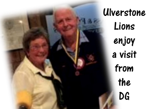
Ulverstone Lions enjoy a visit from the DG

Membership Development Division - Lions Clubs International