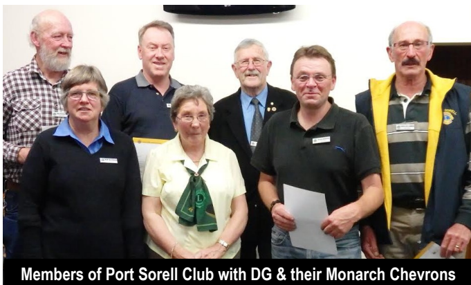
Members of Port Sorell Club with DG & their Monarch Chevrons

It is interesting that the Clubs I have visited so far, all have some fun and fellowship. For instance: Devonport Mersey got into the swing for ALF Finals with a very active handball competition, which makes my visits friendlier and I learn little personal snippets about the members, from the side remarks and comments, without the members being aware, which I would not normally know!