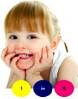
children has an undetected vision problem