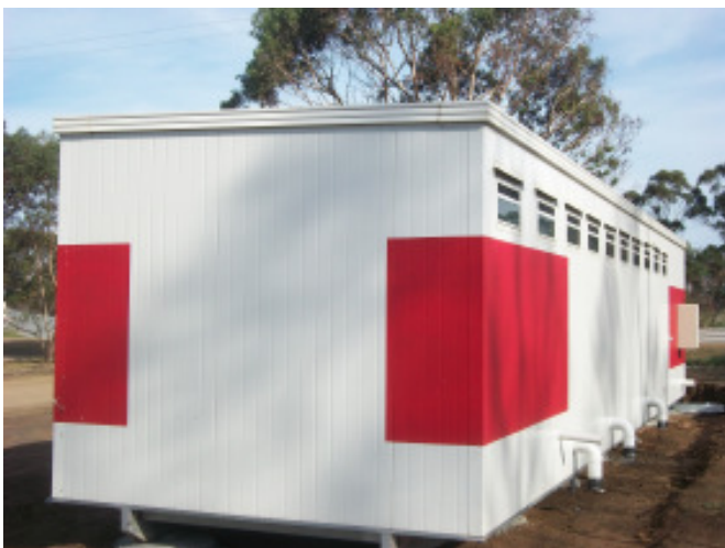
The Lions Community Amenities Unit on site in Bay Street, Dunalley

The Lions Community Amenities Unit , a converted relocatable building, has been delivered to Dunalley and will be up-and-running before the end of May.