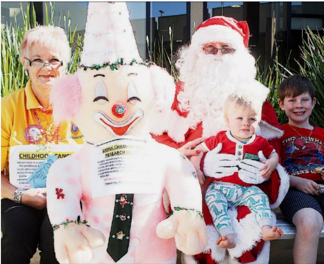
The Lions Club of Kingborough along with the support of local businesses, people and organizations have raised $3793 for childhood cancer research. Throughout December members of the Lions Club could be found wrapping gifts for a donation, providing breakfast and walking around with Santa.